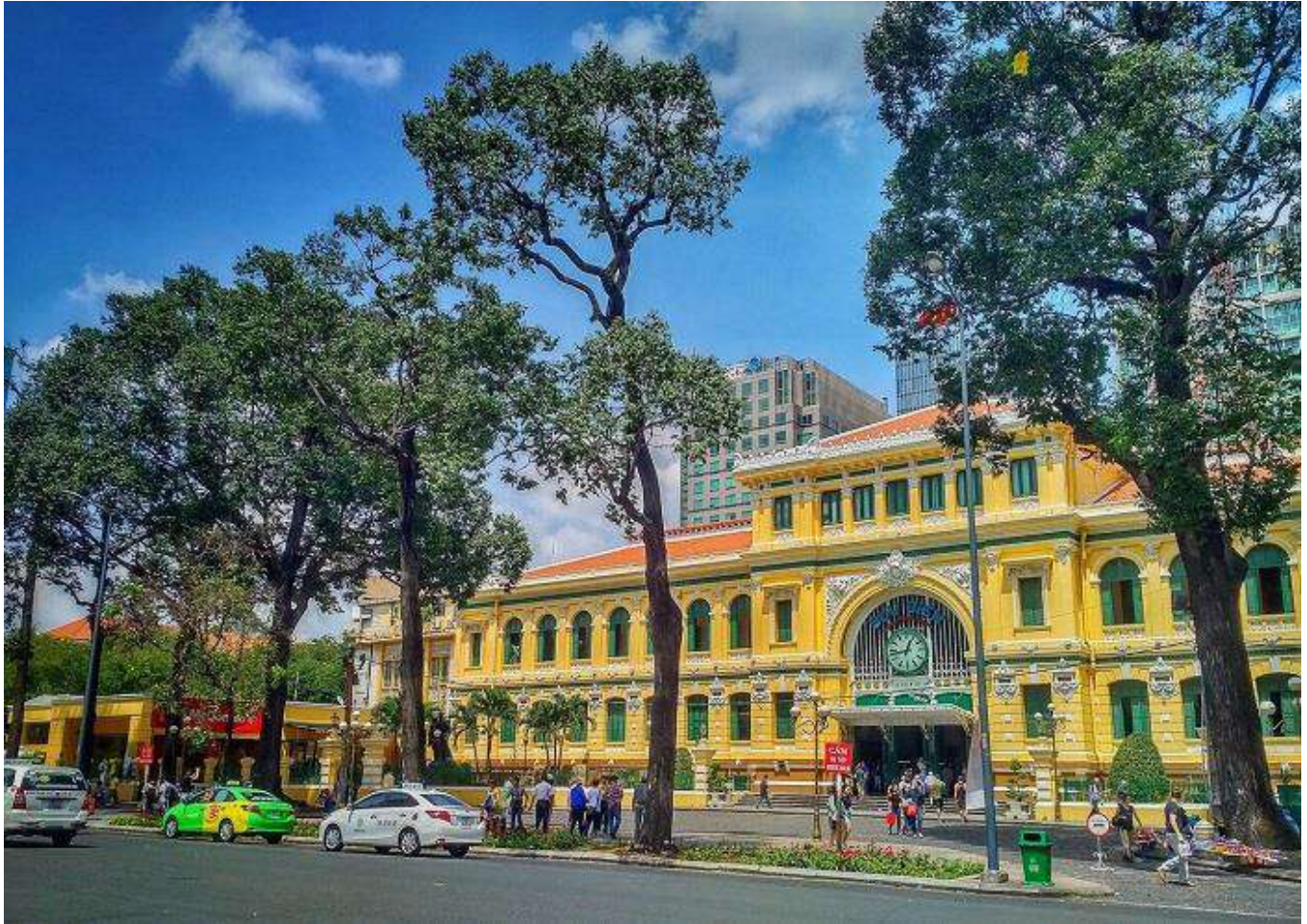
Centre Post Office